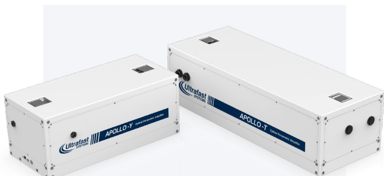
Optical Parametric Amplifiers

The Apollo OPA line is optimized to work with all our spectrometers on the Ti:Sapphire or the Yb platforms. These OPAs have been designed as a capable yet easy to use pump source with the spectroscopist in mind. They fit neatly alongside the spectrometer, minimizing the amount of table space required. Inclusion of multiple frequency conversion schemes allows fully computer-controlled tuning of the output, while collinear output from a single port reduces the need for external beam routing optics. The timing of the pulse output remains consistent across the whole wavelength tuning range.